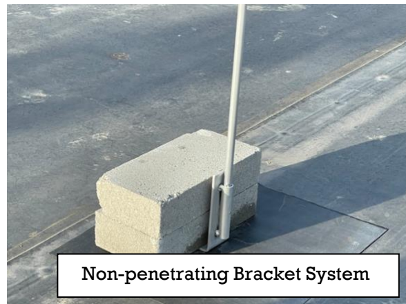
Non-penetrating Bracket System